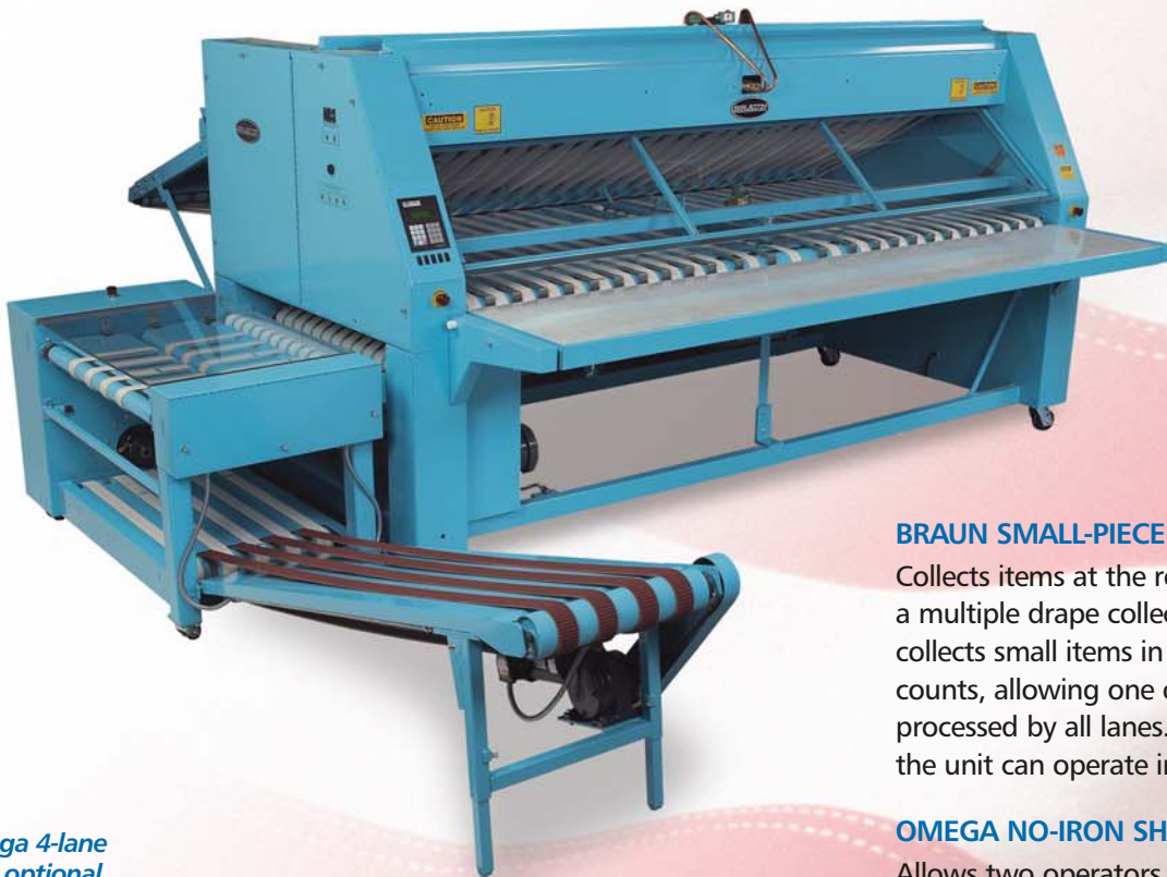
Omega 4-lane with optional Large-piece Flatwork Stacker